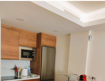
This flat is ideal to enjoy a comfortable and complete stay in Marbella.

It is in a privileged location, just 200 metres from the beach and surrounded by all the services you may need: doctors, schools, restaurants, supermarkets, hairdressers and pharmacies. To this we can add that you will be able to enjoy the atmosphere of the fishing port and exercise in the nearby gym.