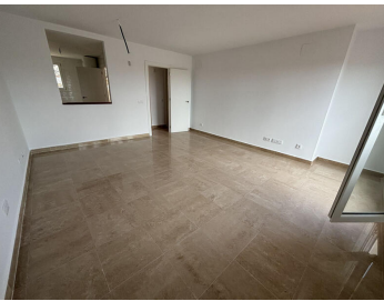
Great investment oportunity.

A corner 3 bedroom apartment at Vistalmar Duquesa Sur urbanization.