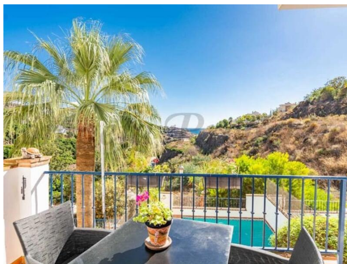
Charming Terraced House with Pool & Sea Views on Tamango Hill

Nestled in the desirable Tamango Hill estate, this wonderful 4-bedroom, 3-bathroom terraced house offers the perfect blend of comfort, luxury, and investment potential. Boasting a private swimming pool, garden, and gated driveway, this home is ideal as a permanent residence or a lucrative holiday rental.