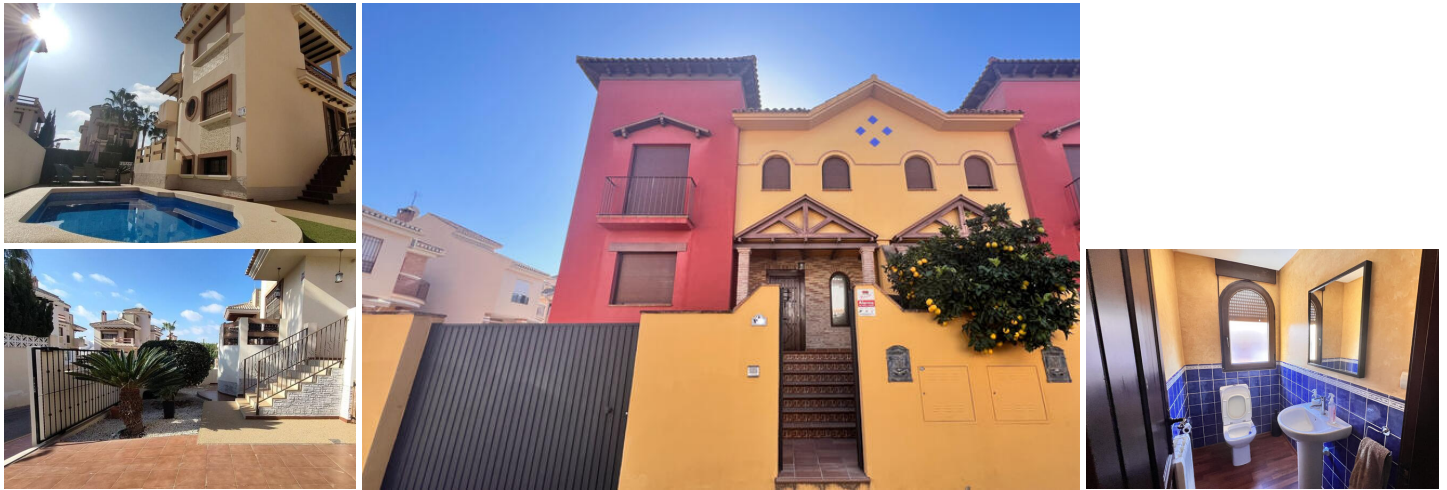
Fantastic 3-Bedroom Townhouse in Los Ogijares, Granada

This spacious and charming townhouse is situated in a quiet residential neighborhood, yet it's just a short walk from all amenities, restaurants, and bars.