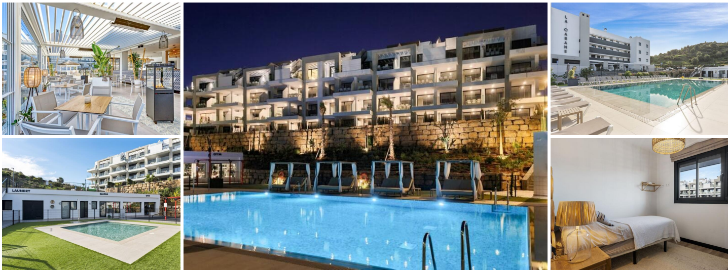
Luxurious 3-Bedroom Apartment in Hacienda del Sueño

Discover your dream home in the heart of the Costa del Sol at Hacienda del Sueño, a premier residential complex nestled between Málaga and Marbella.