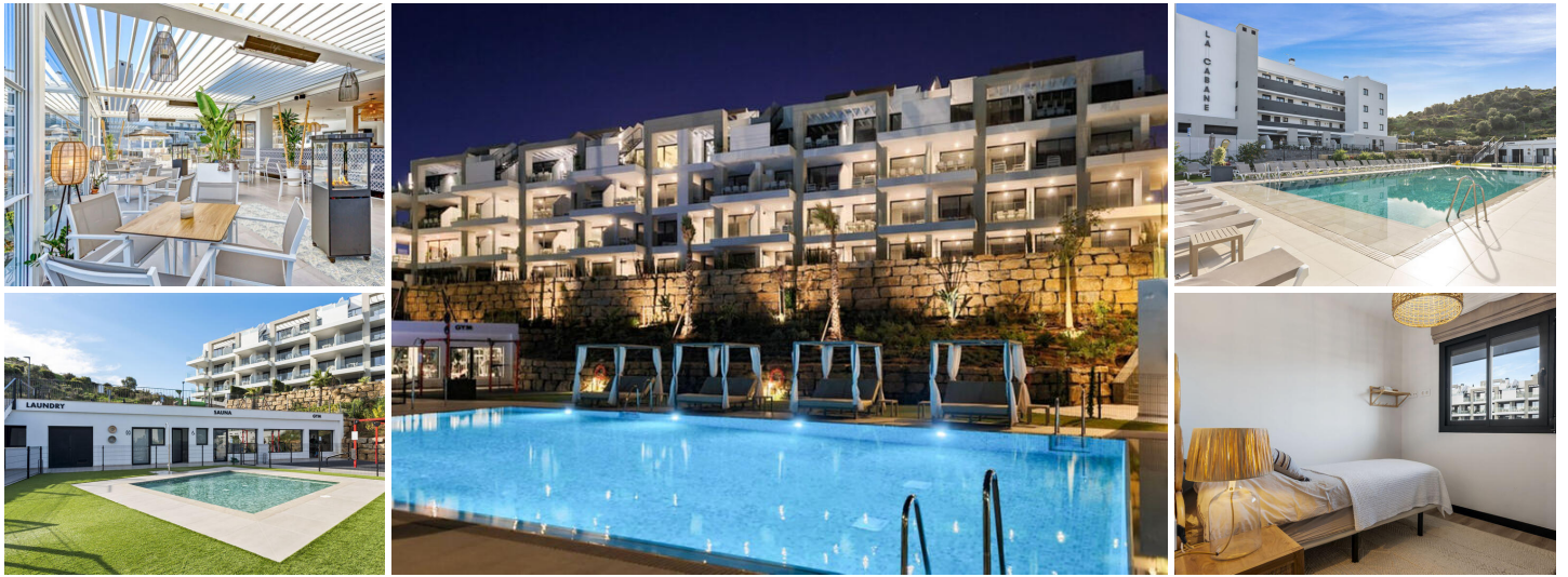
Luxurious 3-Bedroom Apartment in Hacienda del Sueño

Discover your dream home in the heart of the Costa del Sol at Hacienda del Sueño, a premier residential complex nestled between Málaga and Marbella.