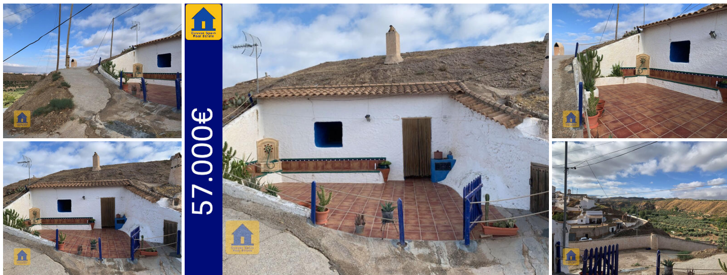
Cueva Sole in Freila

This is a quirky little cave house with nice views of the countryside. It is located on the edge of the village of Freila, not far from the stunning Lake Negratin. The property is a 5 minute walk to the village centre.