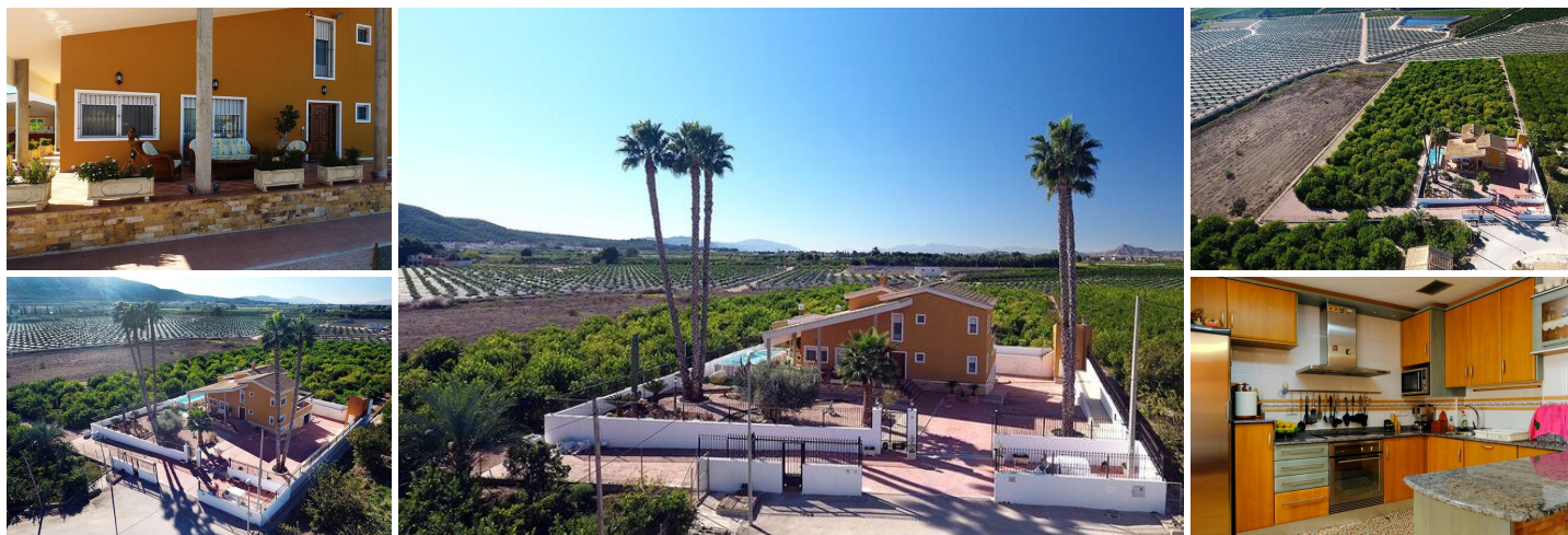
AMAZING COUNTRYSIDE FINCA WITH INCOME

9,480 m2. fully fenced property with 495 m2. house built on a plot of 1,000 m2. all fenced within the perimeter of the property.