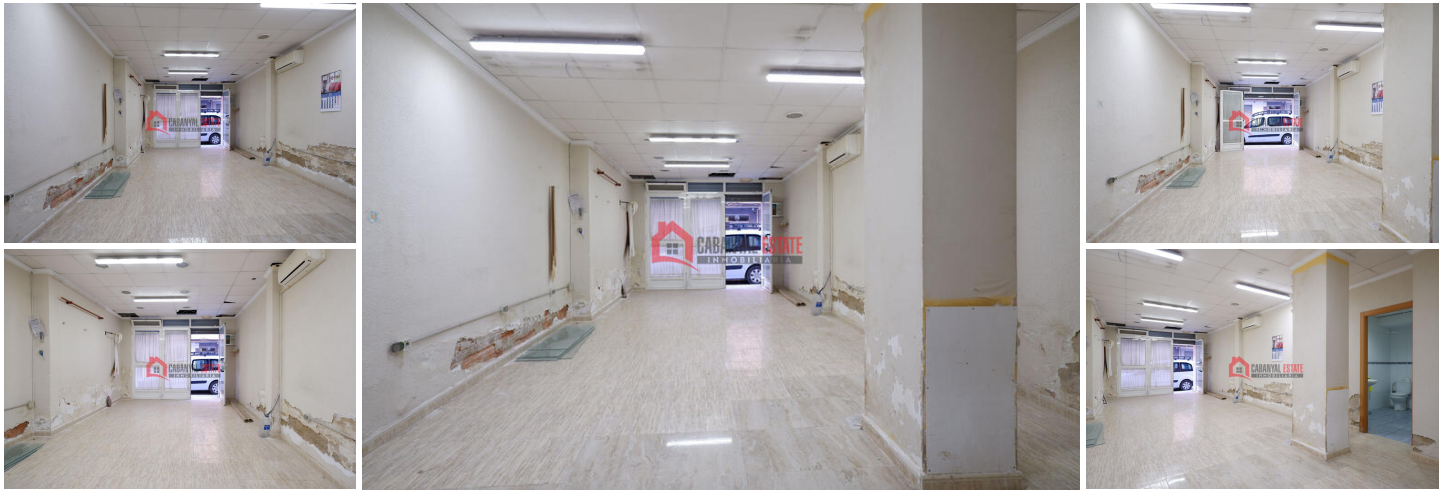
Retail Space for Sale in Carrer de l'Assutzena, Benicalap

Discover an exceptional opportunity with this 60m 2 retail space located in the bustling Benicalap district on Carrer de l'Assutzena. This property features a bright and inviting area with a sliding front door that opens the entire facade, creating an open and accessible entrance for customers. Additionally, the space includes a storage area, a workspace, and a bathroom (see the floorplan for details).