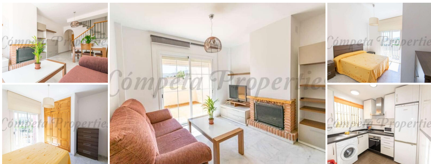
Bright and Spacious 3 Bedroom Townhouse in La Noria, Nerja

Located in the peaceful La Noria area of Nerja, this charming townhouse combines the tranquility of rural living with the convenience of nearby amenities. Positioned between Nerja and Frigiliana, and within easy reach of the LIDL supermarket and main roads, this home offers the perfect balance of seclusion and accessibility.