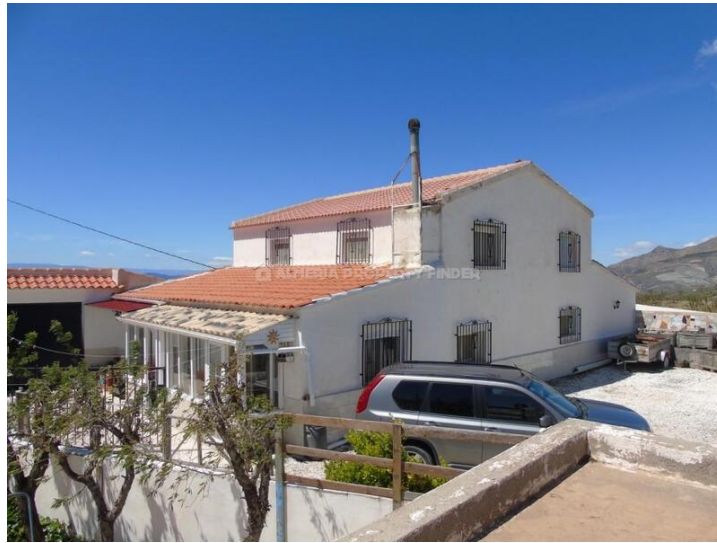
Cortijo Ciruelo - A country house in the Albox area. (Resale)