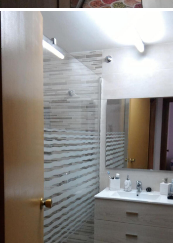
Top Floor Apartment, Fuengirola, Costa del Sol. 3 Bedrooms, 1 Bathroom, Built 110 m².

Condition: Excellent, Recently Renovated.