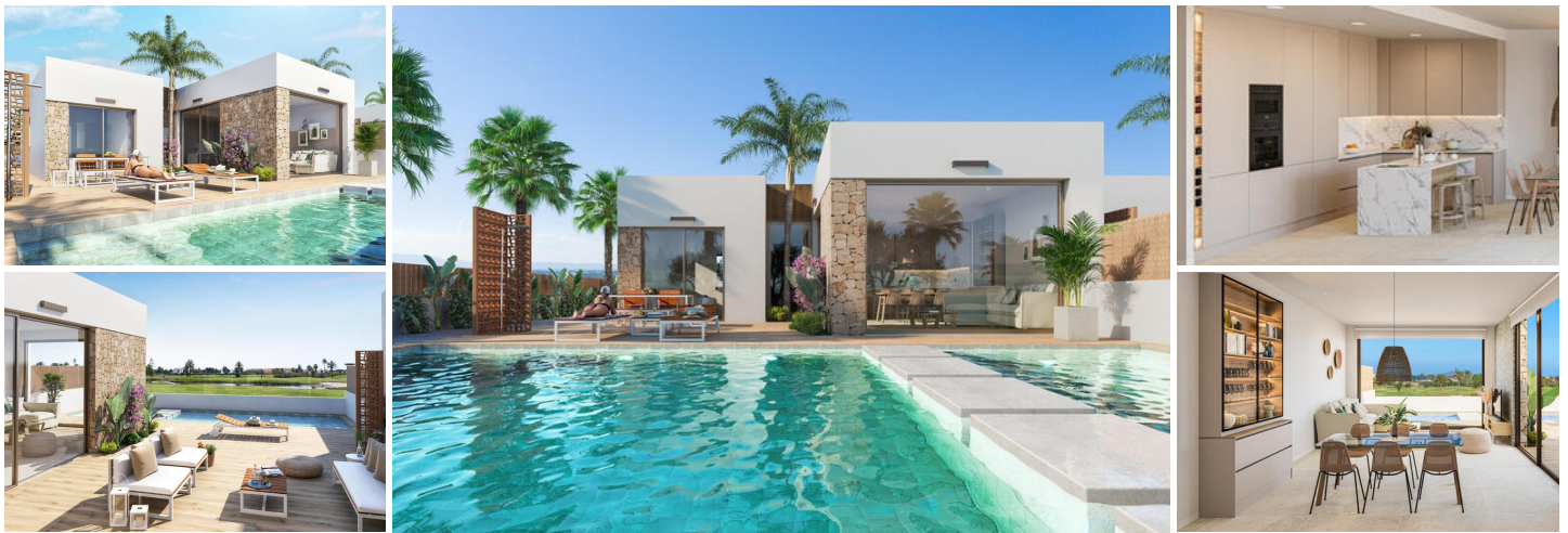
New Build Villas in Los Alcazares

Los Alcázares is an idyllic location for those looking to invest in a new residential property on the Costa Cálida. Just 25 minutes from Murcia Airport and approximately 55 minutes from Alicante Airport, this area is conveniently connected by highway to major cities like Cartagena, Murcia, and Alicante, as well as to other beautiful beaches along the Costa Cálida and Costa Blanca.