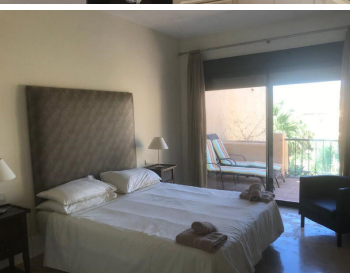
TOP FLOOR 2 BED 2 BATH APARTMENT, FOR LONG TERM RENTAL.

The apartment has a separate fully fitted kitchen with oven, hob, fridge freezer, dishwasher and microwave. The utility room houses the washing machine.