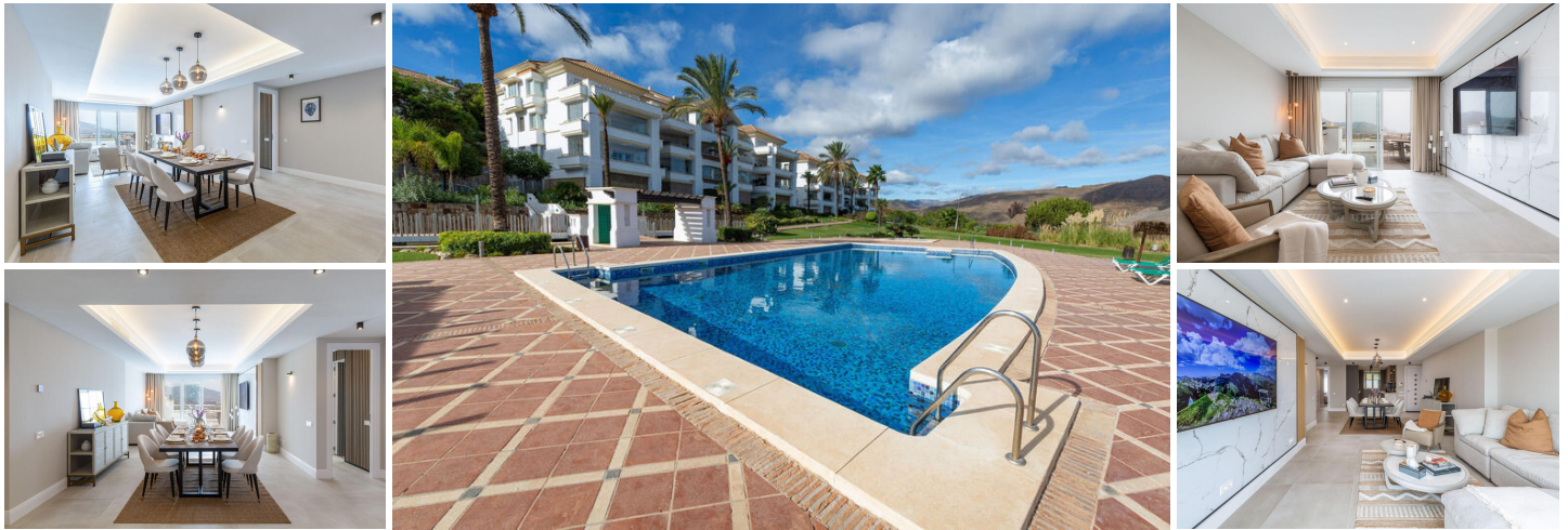
Mijas ... La Cala Golf

FREE Notary fees exclusively when you purchase a new property with MarBanús Estates