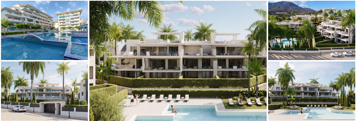
"Luxury Apartments for Sale in Estepona

Discover Sunway Residence Estepona: an exclusive new development featuring 48 apartments and penthouses with two and three bedrooms, located within walking distance of the beach and local amenities in the beautiful area of Arroyo Enmedio in Estepona on the Costa del Sol.