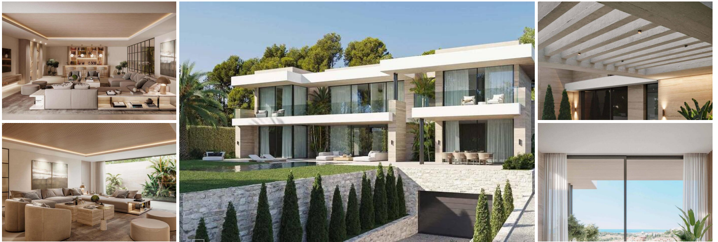
Fabulous Brand New Villa in Prime El Paraiso Location

Nestled in the prestigious El Paraiso neighborhood, this spectacular villa offers an unparalleled blend of luxury, privacy, and modern living. Set on a prime corner plot with a private cul de sac entrance, this stunning new property exemplifies refined elegance and sophisticated design.