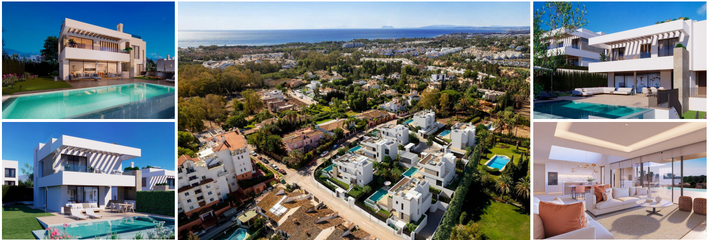
NEW CONTEMPORARY VILLA - Atalaya (New Golden Mile)

This new development of luxury south facing detached villas is in a prime location of Estepona, in walking distance to Atalaya Golf Club and within a short drive to all amenities and the beach, which can also be reached by a 25 min walk. Puerto Banús is just less than 10 minutes away so that you can enjoy its marina, the exclusive shops on the Golden Mile and, the top-end restaurants with their Michelin stars.