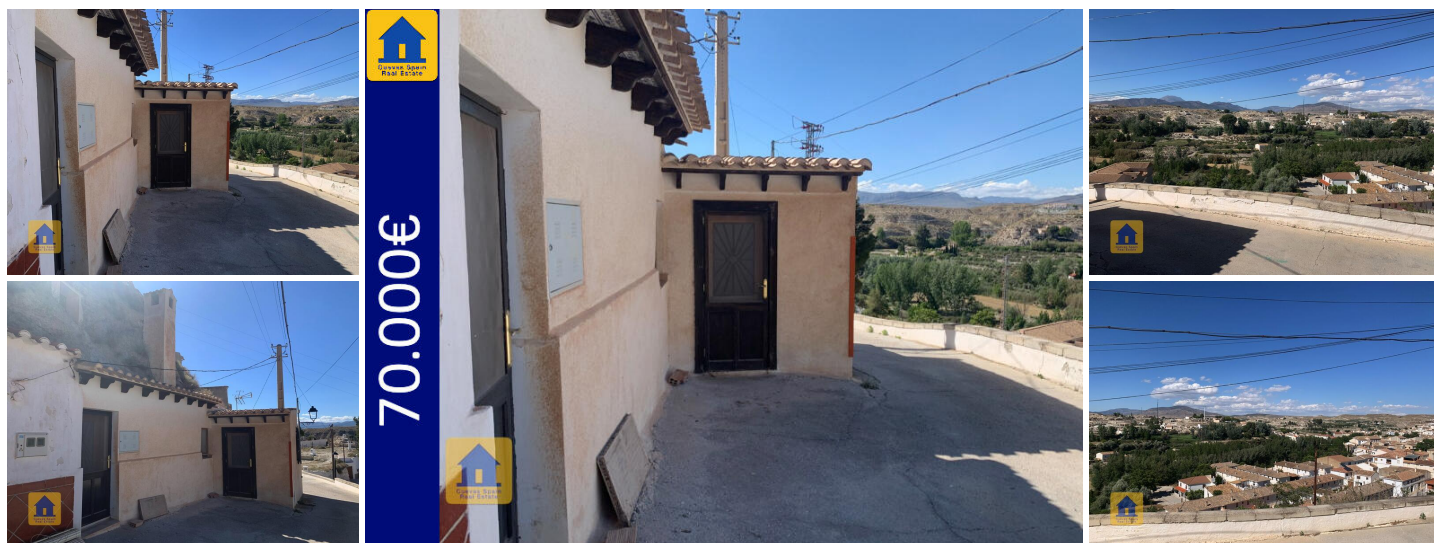
Cueva Serafin in Galera

This is a quirky, traditional, Spanish cave house with great views over the popular village of Galera! This property can be lived in right away or you could do some modernising to create a truly delightful home for holidays or full time living. Parking is at the front of the property. Amenities are a 5 min walk into the village.