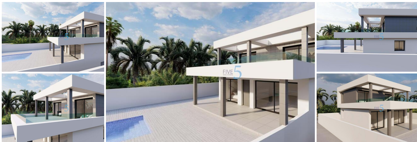
NEW BUILD VILLA IN ROJALES

New Build modern villa in Rojales close to all amenities and services.