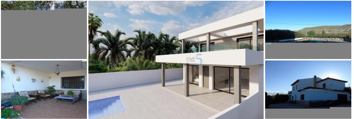
NEW BUILD VILLA IN ROJALES

New Build modern villa in Rojales close to all amenities and services.