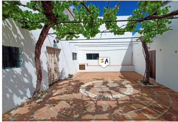
HOUSING IN FIRST LINE OF SEA