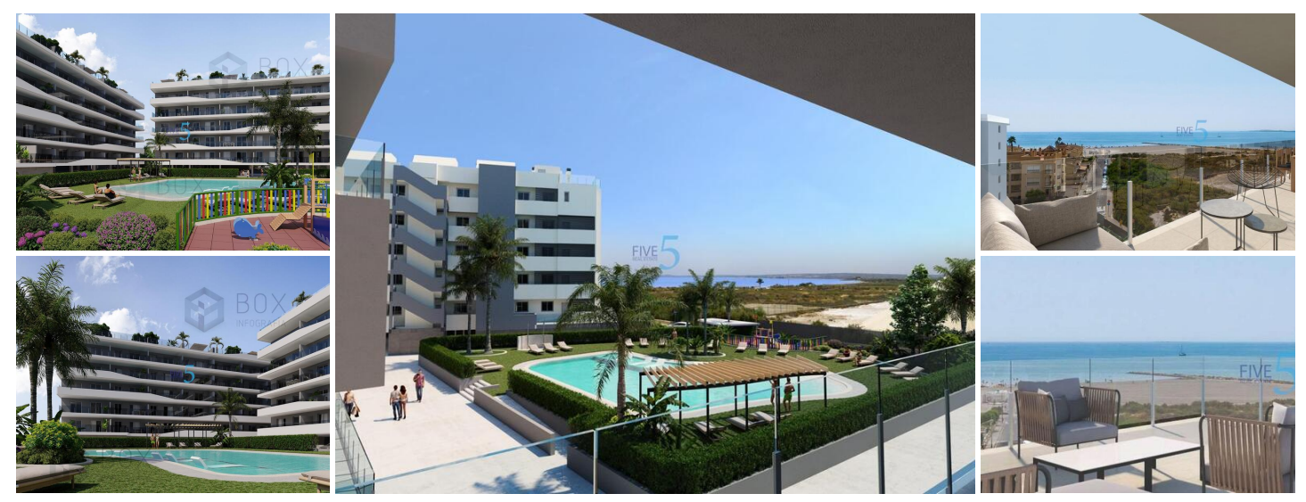
NEW BUILD RESIDENTIAL COMPLEX IN SANTA POLA

Modern gated residential complex comprising 3 blocks of apartmwnts with large landscaped communal areas including a swimming pool with water beds, children's playground, pergola and bicycle parking.