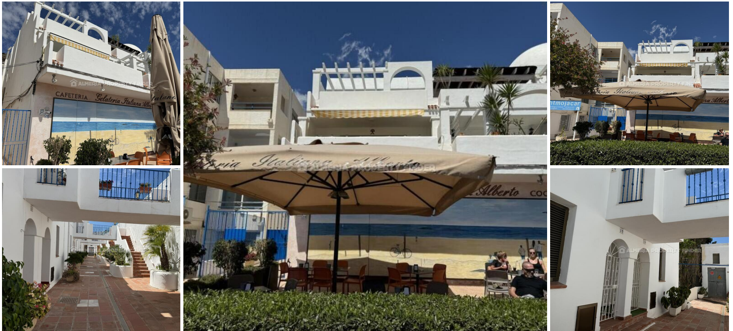
Apartment Nam I - An apartment in the Mojácar area. (Resale)

Urbanization Marisol: Excellent front-line apartment that is beautifully presented and offering the most spectacular sea and beach views. The apartment is situated in a most sought after area of Mojácar Playa, Las Ventanicas, and is positioned to take full advantage of the local amenities with everything you need within striking distance. The property comprises 3 bedrooms & 2 bathrooms. The open-plan living room & kitchen are elegantly modern and present a great space for dining. The kitchen area has a really good, useable central island with white silestone top. From the living room you have access to the terrace with its awnings and it is from here you can enjoy the Mojácar sunrise. Both of the bathrooms; the guest & the en-suite have been fully modernized.