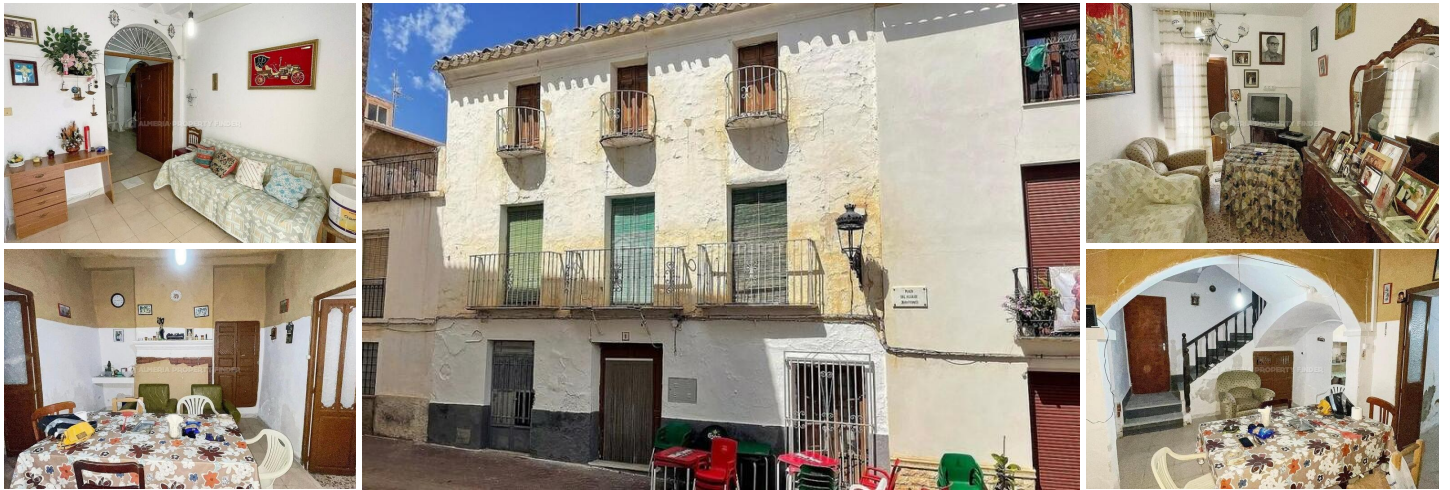
Casa Juan - A town house in the Albánchez area. (Habitable)

A fabulous opportunity to purchase an 8 bedroom townhouse set over 3 floors with a usable space of 321 m 2 . This classic Spanish town house is in good basic condition but is in need of modernisation and is located in the center of town just off the main square. The pretty village of Albánchez offers all amenities for daily life, including a bakery, a butcher, supermarket, school and medical centre and also has an array of good bars and restaurants. Albánchez is situated 20 minutes from the larger market town of Albox.