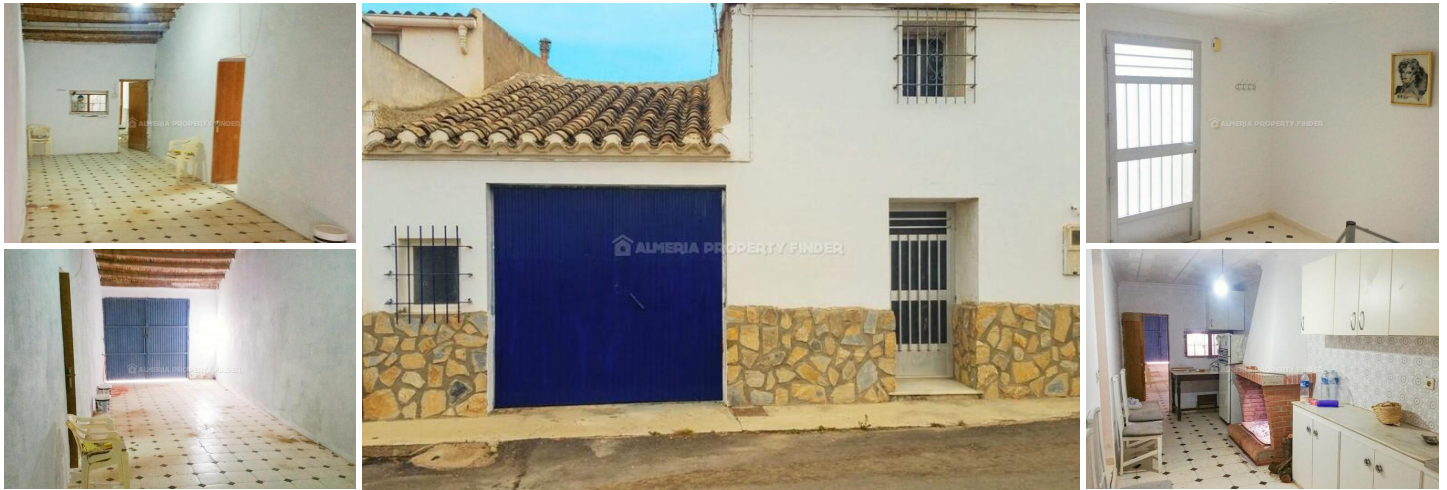
Casa Noria - A town house in the Huercal-Overa area. (Partially Reformed)

Large 4 bedroom, 1 bathroom village house with garage situated in a small hamlet only 10 minutes from the large town of Huercal Overa and 20 minutes from the coast.