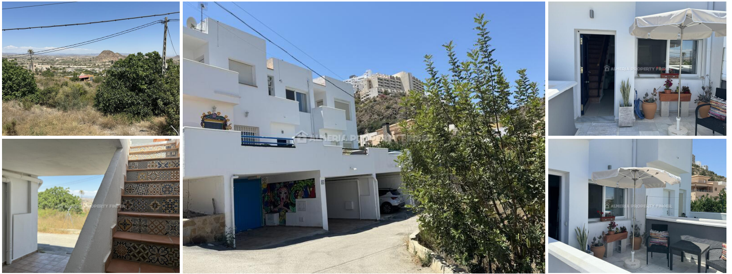
Town House Sharolyn I - A town house in the Mojácar area. (Resale)

Huertas de Abajo : Beautifully reformed three-storey property with a closed garage for two cars and a car port for an additional car. This attractive property is situated just a 10-minute drive to Mojácar's beaches, bars and restaurants and has stunning countryside views and views of Mojácar Pueblo.