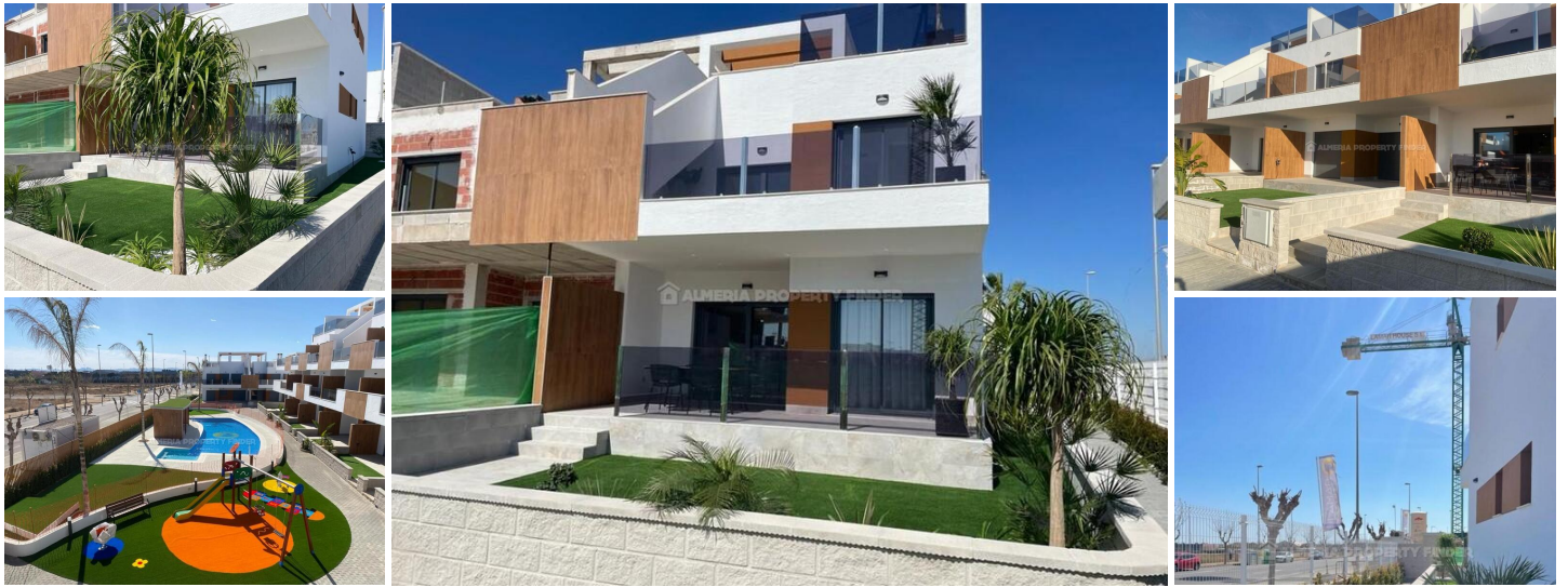
Lamar Resort Vii A14-b2 - An apartment in the Pilar de la Horadada area. (Newly Built)

LAMAR Resort Luxury VII is a luxury project of 34 apartments with 2/3 bedrooms and 2 bathrooms divided into 3 blocks with communal swimming pool, jacuzzi, gym, playground and garage with storage room. The ground floor apartments have large gardens, the first floor has terraces and the penthouses have a solarium with jacuzzi. The facades of these buildings are clad with high-quality ceramic tiles combined with a white dirt-resistant monolayer.