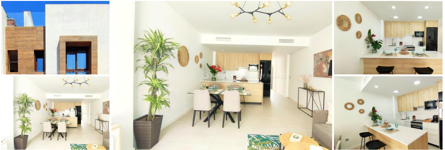
Residence CARMEN III 7 - A town house in the San Javier area. (Newly Built)