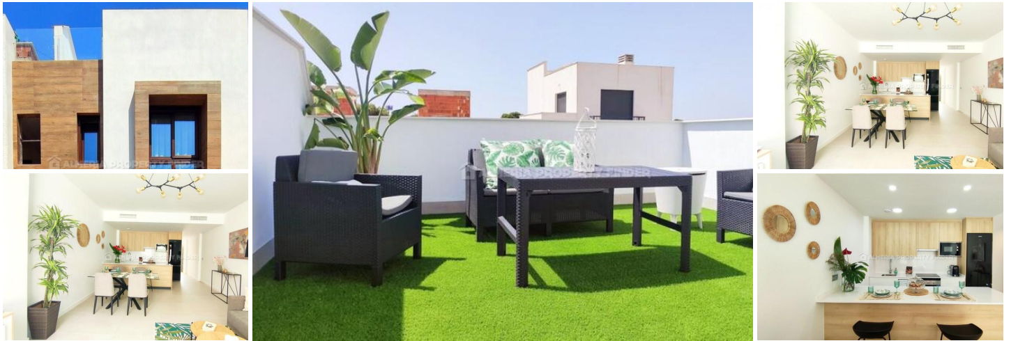
Residence CARMEN III 4 - A town house in the San Javier area. (Newly Built)