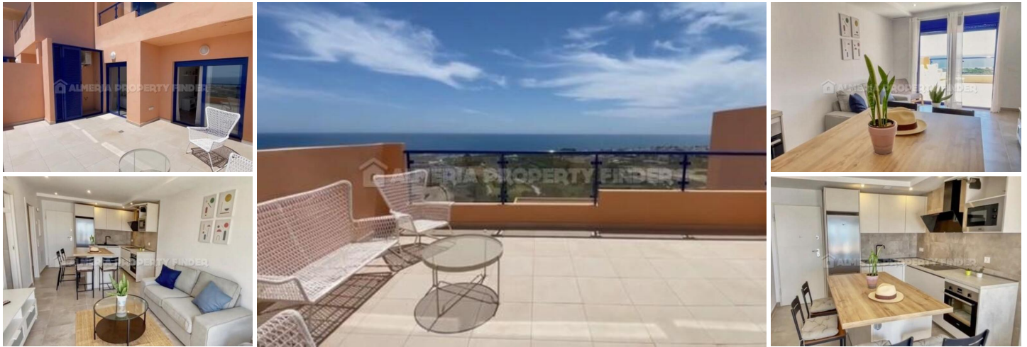
Apartment Mirador 1 - An apartment in the Mojácar Playa area. (Newly Built)