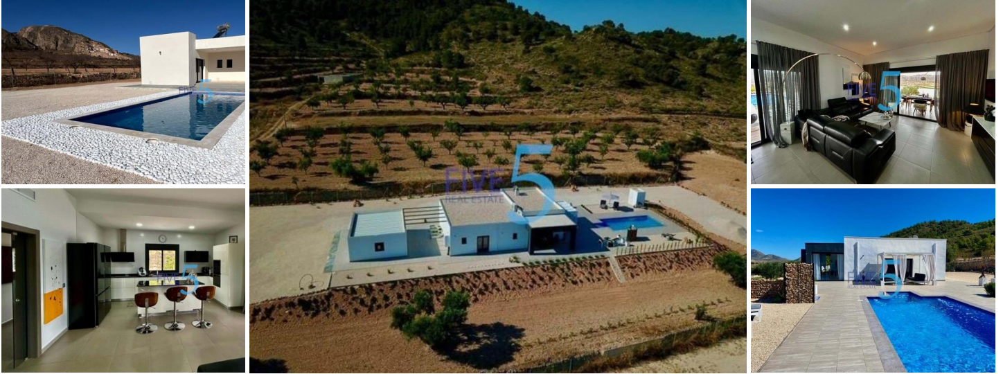
NEW BUILD VILLA IN ALBANILLA, MURCIA

New Build villa on a large plot in the municipality of Abanilla, province of Murcia.