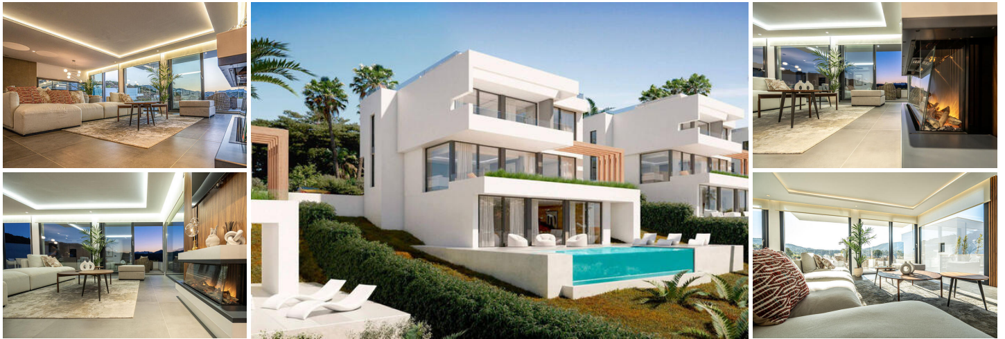
LA CALA DE MIJAS VILLAS

FREE Notary fees exclusively when you purchase a new property with MarBanus Estates