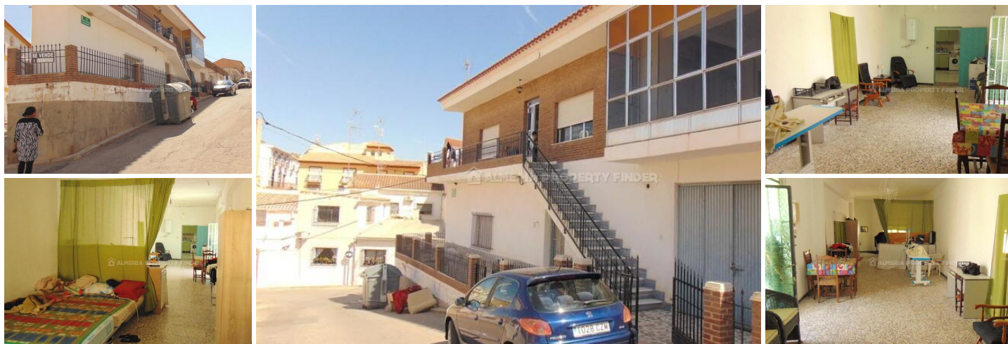
Casa Elena - A town house in the Zurgena area. (Resale)

This large village house is located in the center of Zurgena. Consists of a large open ground floor, garage, 2 bathrooms, 3 bedrooms, fitted kitchen, living and dining area, terrace and a city garden of 250 m 2