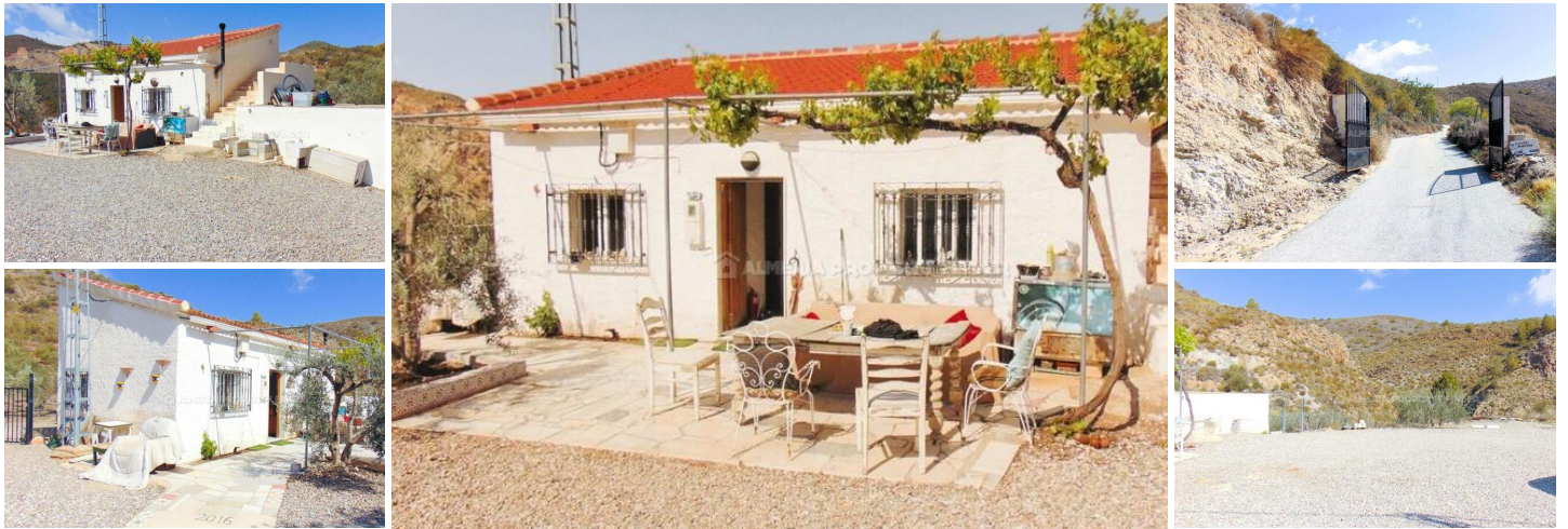
Cortijo Josefina - A country house in the Lijar area. (Renovated)

This basic cortijo consisting of a living kitchen, 1 bedroom and a toilet/shower room is located 2 km from Lijar, a small village with 2 bars, a doctor and a pharmacist. Macael is just a 15-minute drive away. This village is best known for its marble quarries. In Macael you will find all amenities such as supermarkets, shops, doctors, pharmacists, bars and restaurants.