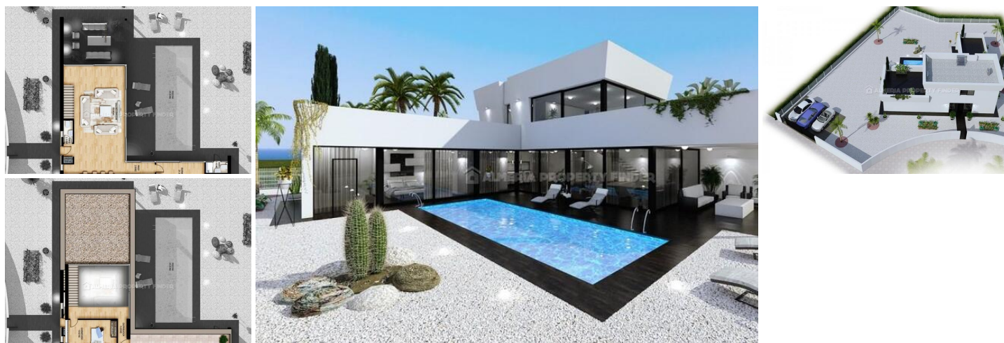
Villa Cabuzana 6 - A villa in the Vera area. (Off Plan)

Fabulous off plan villas in the area of La Cabuzana de Vera.