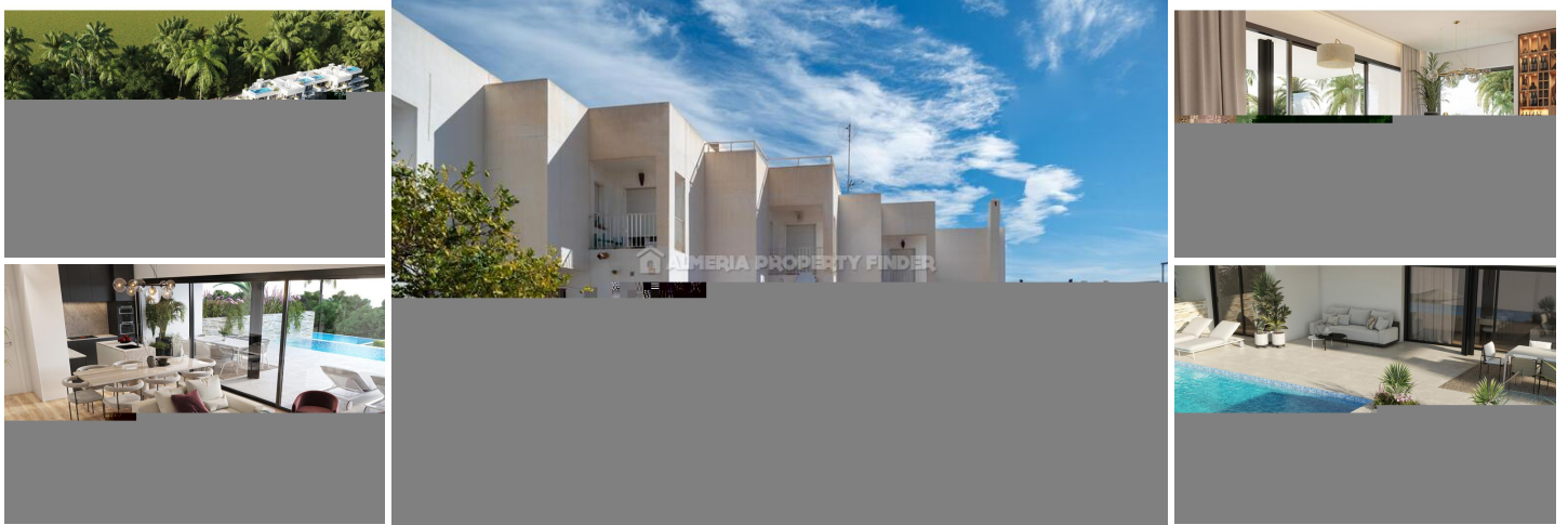
Town House Vita I - A town house in the Mojácar Playa area. (Resale)

Urbanization Montemar: Spacious 3 bedroom triplex in a fashionable area of Mojácar, close to the Parque Commercial Centre and close to beaches, bars, restaurants and amenities. All the amenities that you need are within easy walking distance. This South facing property is Just one of eight properties on this complex that share a communal swimming pool. The property comprises at street level the entrance terrace with double gates allowing space for parking. Go into the house and you have a spacious living room with patio doors to the terrace with awnings, and with gated access to the communal swimming pool, a good-sized kitchen, and a cloakroom. A wooden staircase from the living room takes you up to the first floor where you have the master bedroom with en-suite bathroom and two further double bedrooms and a guest shower room. A wooden staircase takes you from the living room down to the integral garage and a large area perfect for a workshop, or extra storage. There is a very useable solarium from where you can enjoy the most spectacular views of Mojácar village and the sea.