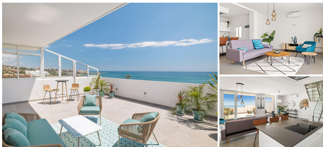
Penthouse Horizonte - Panoramic sea view in 1st line of beach - Estepona

In a private residence with direct access to the beach of Estepona, we present this bright duplex renovated in 2020. Facing south, it consists on the main level of a living room with a fully equipped open kitchen, all with direct access to a large terrace offering spectacular views of the Mediterranean coast with 180° of shades of blue.