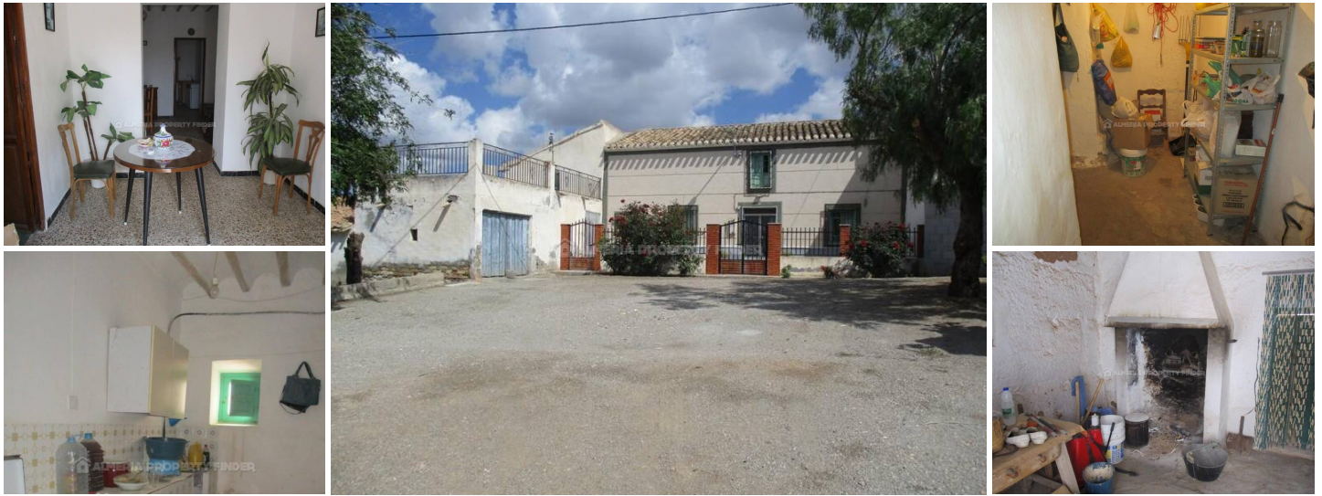
Cortijo Matias - A country house in the Oria area. (Habitable)

Habitable 4+ bedroom country property for sale in Almeria Province, situated on the Rambla de Oria around 15 minutes drive from the towns of Oria and Albox, both of which offer a wide range of amenities including shops, supermarkets, tapas bars, restaurants, schools and 24 hour medical centres.