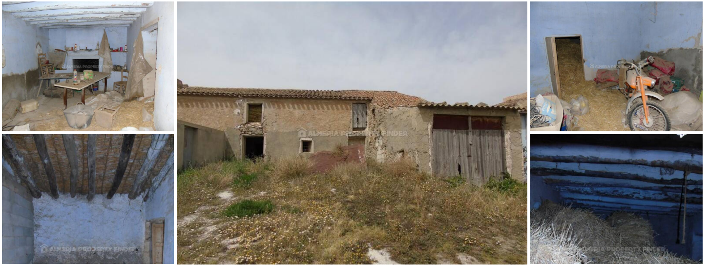
Cortijo Gloria - A village house in the Chirivel area. (For Renovation)

For complete renovation, this two storey village house has the potential to become a lovely 2/3 bedroom family home. The property is situated in a small rural hamlet around 7 minutes drive from the lovely town of Chirivel which offers all amenities for daily living.