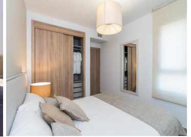
Casa Tania - A village house in the Albox area. (Habitable)

Huge semi-detached 4+ bedroom village house situated in a small village with basic amenities including a bar, bakery and pharmacy. The village is only 10 minutes from the large town of Albox which offers all amenities including shops, supermarkets, banks, schools, cafes, bars, restaurants, sports facilities and a 24 hour medical centre.