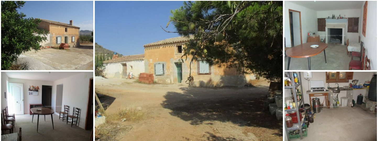
Cortijo Solano - A country house in the Oria area. (Partially Reformed)

Traditional detached 4/5 bedroom country house for sale in Almeria Province, situated 3km from the town of Oria which offers all amenities including bars, restaurants, supermarkets, bakery, butchers, banks, 24 hour medical centre, and pharmacy. There is also an outdoor municipal swimming pool which is open during the summer months, and a small market every Sunday morning. Oria is just under an hour from the coast, and around 1 hour 20 minutes from Almeria airport.